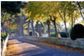
Loftus Cemetery Road