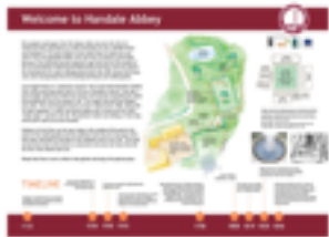
Abbey information board