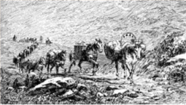
Pack Horse Train